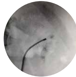
Removing the obturator; commencing lithotripsy using a holmium laser. Stone dust exited the space between the scope and the ClearPetra sheath.