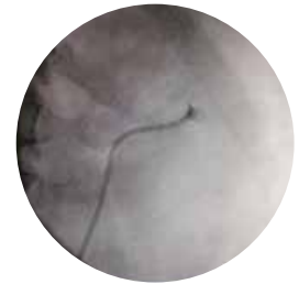
Placement of a Double-J stent after removal of the ClearPetra sheath

If any misunderstanding occurs due to print failure or misunderstanding of the content, Well Lead reserves the right of final explanation.