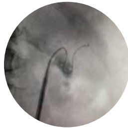
Advancing the ClearPetra sheath over a guide wire

Flexible ureteroscopy and Holmium Laser Lithotripsy with the ClearPetra Ureteral Access Sheath in a patient with renal stones of 20 x 25mm 2